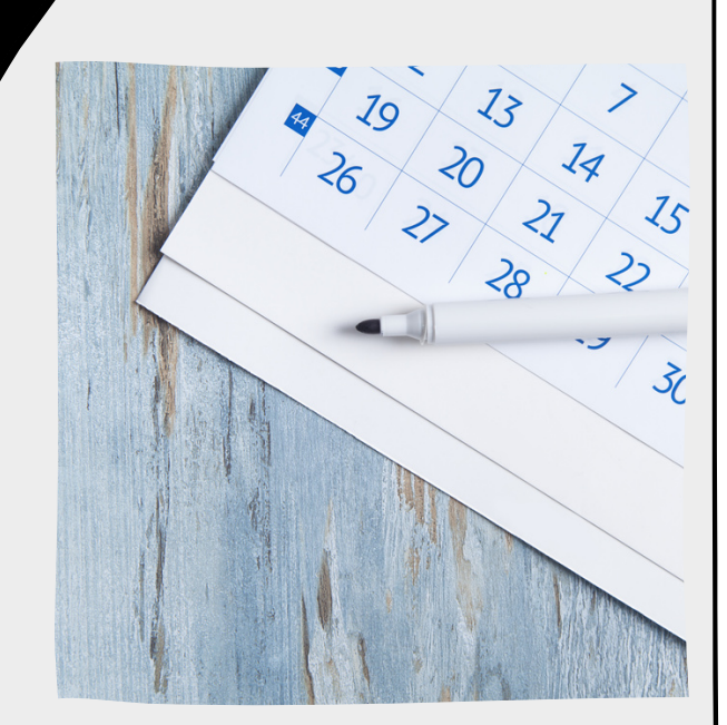
FOR ALL THINGS SENIOR YEAR GO TO...